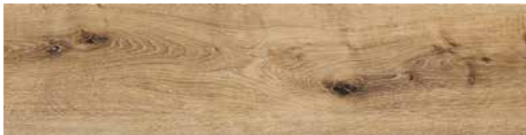
Oak Trentino TIR960B1022J