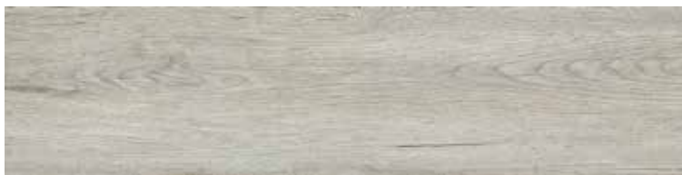
White Oak Polar TIR960S0122J