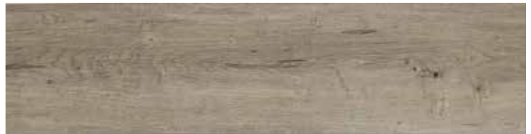
Oak Sacramento TIR960S1922J