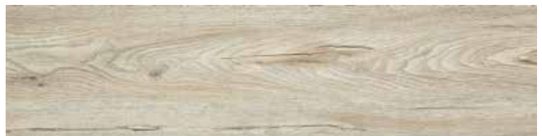
White Oak Sand TIR960S0622J