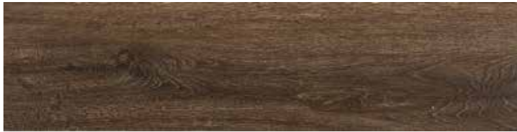
Bush Oak Smoked TIR960S0522J