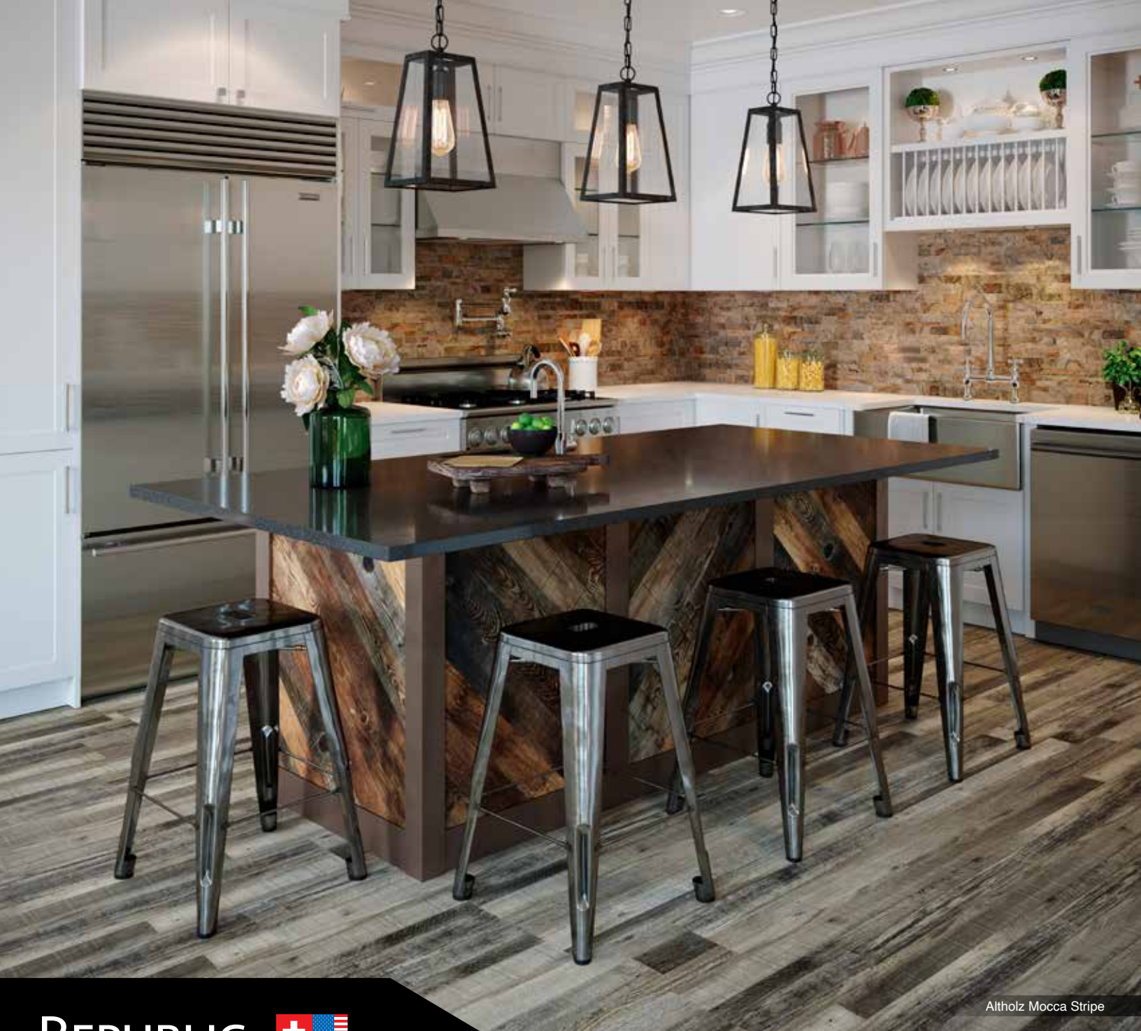
Altholz Mocca Stripe