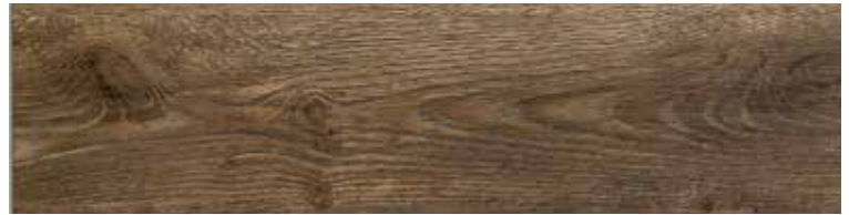
Oak Meramec TIR960S1722J