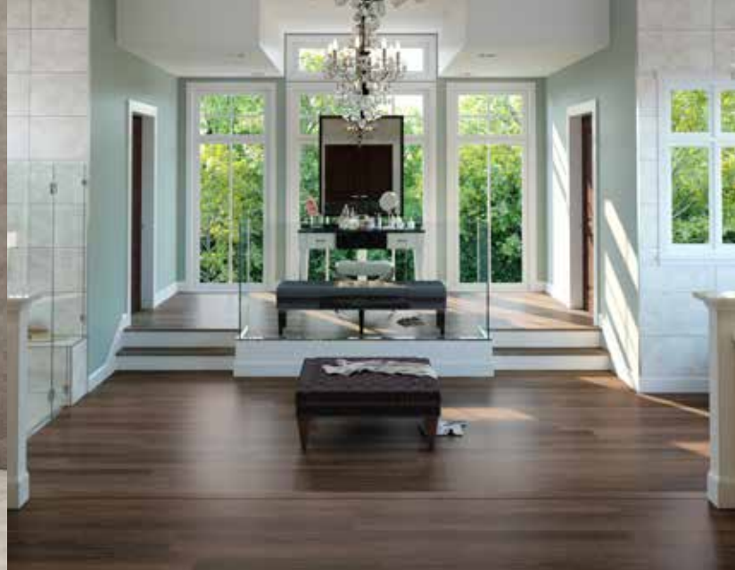
Bush Oak Smoked