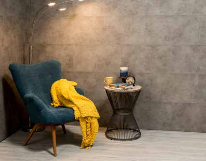
White Oak Polar