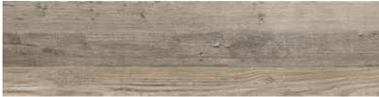
Altholz Macchiato Stripe TIR960S0822J