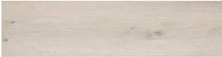
Oak Emmen TIR960B1222J