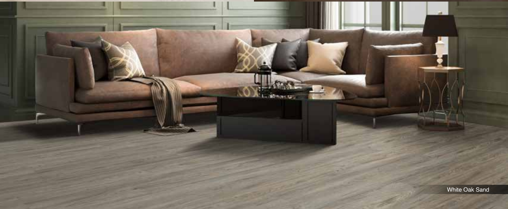
White Oak Sand