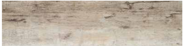
Larche Zermatt TIR960S1122J