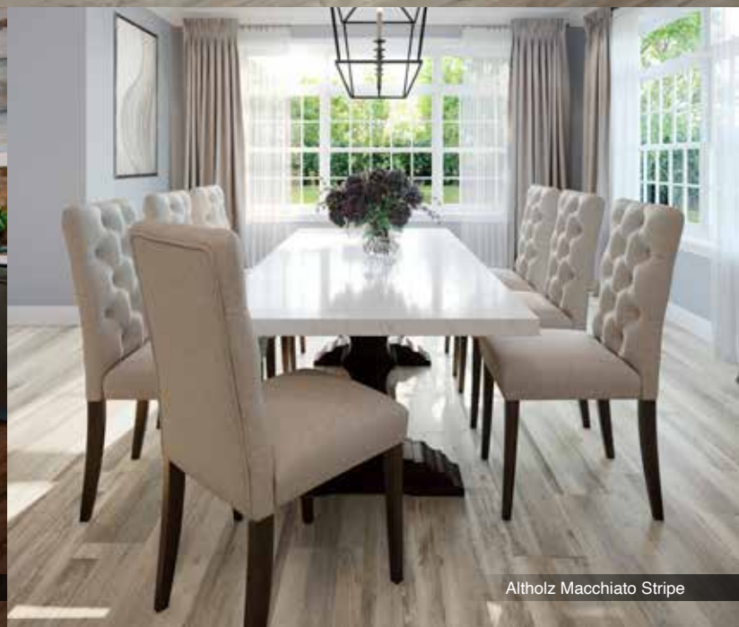
Altholz Macchiato Stripe