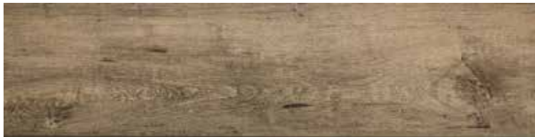
Oak Missouri TIR960S2022J