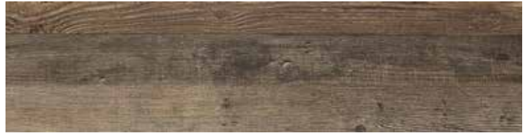
Altholz Mocca Stripe TIR960S0922J