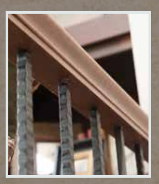
Iron Balusters Installed to handrail