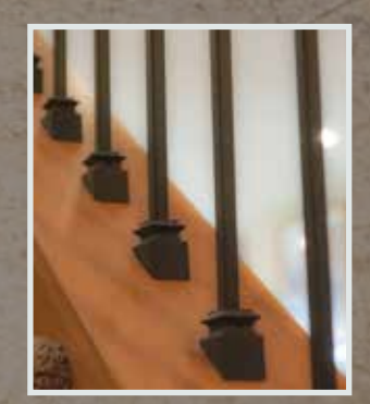
Iron Balusters Installed with pitch shoes