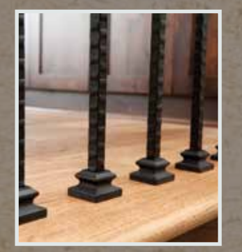
Iron Balusters Installed to hardwood floors with flat shoes