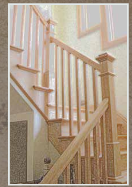
Post To Post with open tread

In an OVER THE POST staircase design, the handrails run over the newel posts and the balusters are fitted into the handrailing. These types of staircases, require the use of fittings and volutes. A POST TO POST staircase design, is a system where the handrail is mounted between the newel posts. These are the most common of staircase designs, these systems can use box newel or standard smaller newels.