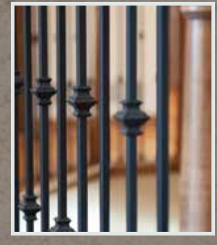
Iron Balusters With ALAK01 Universal Knuckle

In an OVER THE POST staircase design, the handrails run over the newel posts and the balusters are fitted into the handrailing. These types of staircases, require the use of fittings and volutes. A POST TO POST staircase design, is a system where the handrail is mounted between the newel posts. These are the most common of staircase designs, these systems can use box newel or standard smaller newels.